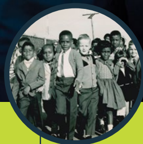
American Experience: The Busing Battleground