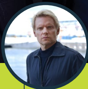
Van der Valk on Masterpiece