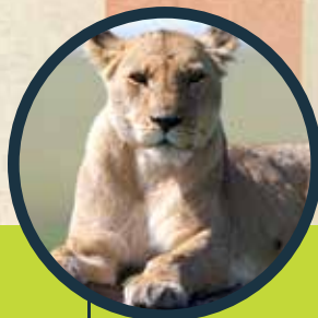
Lion: The Rise and Fall of the Marsh Pride