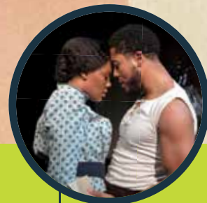
Great Performances: Intimate Apparel