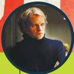
Van der Valk on Masterpiece