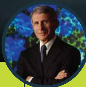
Crosscut Festival Main Stage